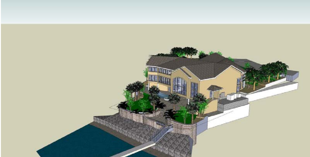
This is a SketchUp model of a single family home and landscape that Duane worked on, Lake Wylie, SC. 2006.