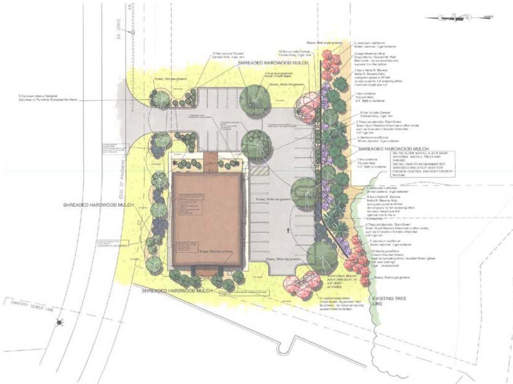
This is a planting and circulation project for Cope Construction in Rock Hill. Rendering by Tripp Barrineau. Installed November 2008.